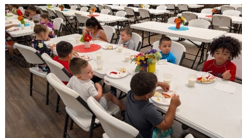
Older group preparing the snack which is part of the Bible lesson.