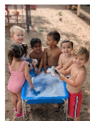
Two yr old class enjoying water play after their VBS class.

We have a full schedule for the month of July. It is always our busiest month because normally all our kids are here. Bonzo Crunch the Clown will be here at the Fellowship Hall on July 10 th at 9:30 a.m. Small Wonders Puppet Show will be here on July 17 th at 9:30 a.m. We welcome anyone that would like to come share these performances with us. They both last only an hour but are always enjoyable. The field trips that we have planned are A Slice of Heaven Educational Farm on July 18 th where the children will enjoy touring the farm, feeding the large animals, doing all the activities they have planned for us and going on a hayride. We will be taking two groups to Mt. Playmore in Pflugerville on two different days. Bowling at Spare Time on July 31 st . Everyone have a blessed and safe 4 th of July. The CDC will be closed.