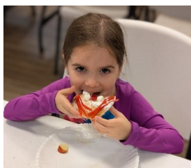
After creating the VBS Snack it's always fun to eat it.