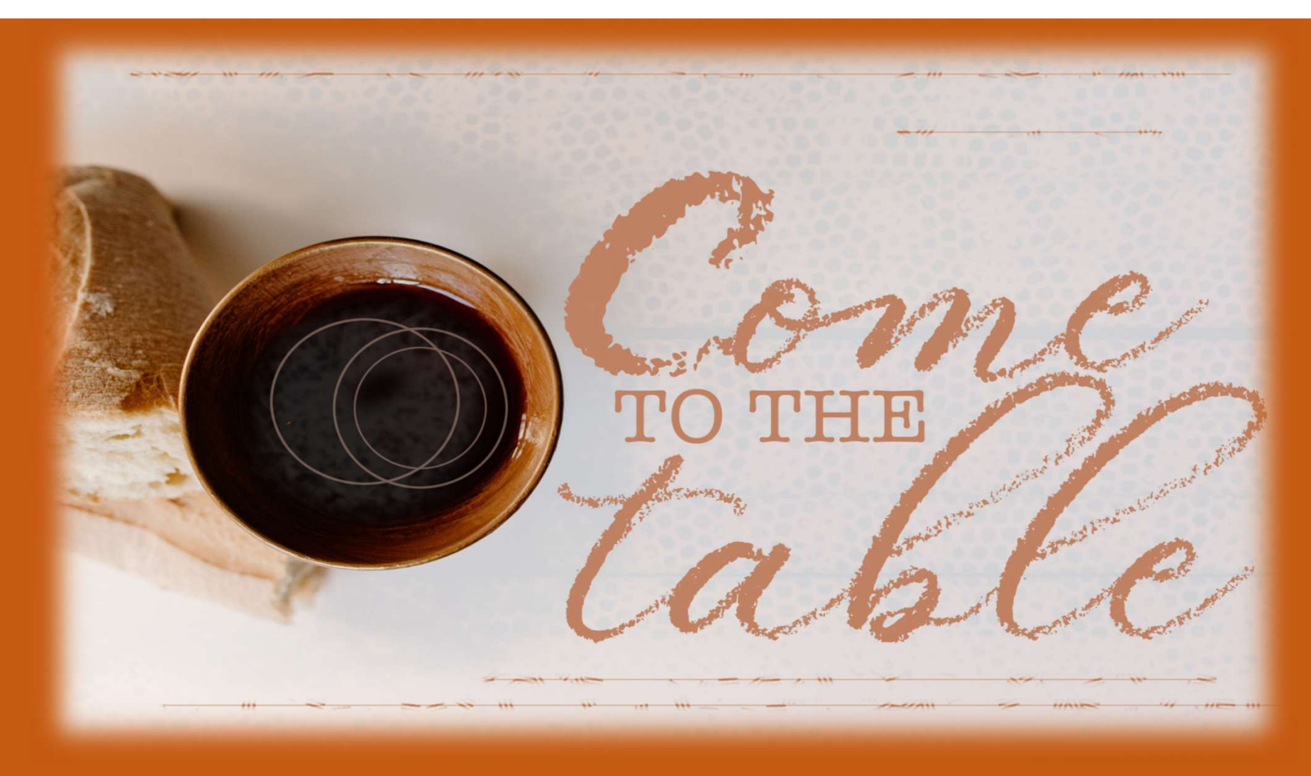
Holy Communion is offered both in the center aisle line and at the altar rail.