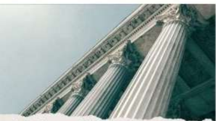
ate's Judgment Hall