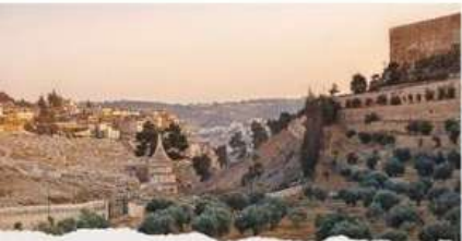
e Mount of Olives