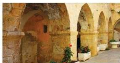
The High Priest's Courtyard