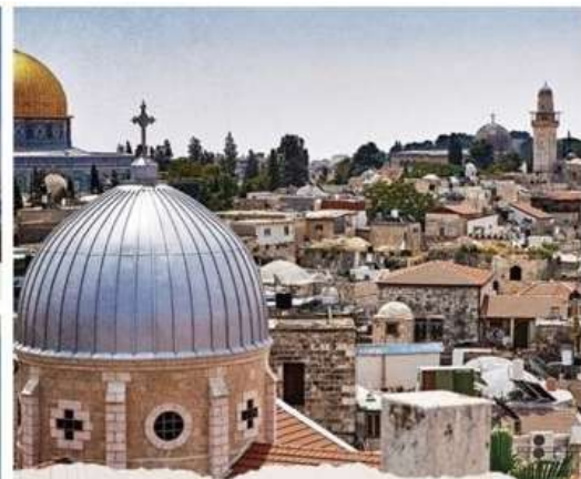
The City of Jerusalem