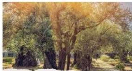
The Garden of Gethsemane